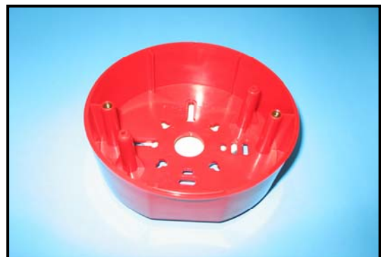
Model.FPE.CL-205 MANUAL ALARM BASE